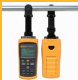
TPAK Magnetic Hanger