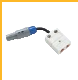
Universal Thermocouple Adapter