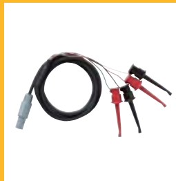
Universal RTD Adapter