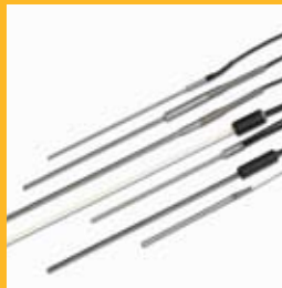
Calibrated Temperature Sensors

A wide array of accessories is available to help you maximize productivity, but the following are essential for most users.