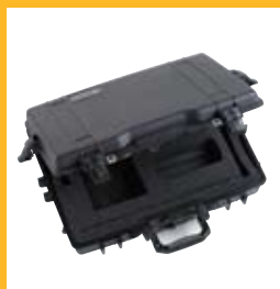
Probe and Readout Case